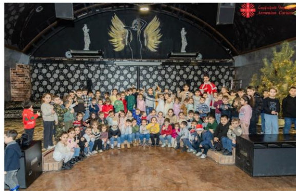
Figure 4 Christmas Celebration Event for the refugee children