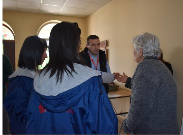
Figure 3 Psycho-social work with the displaced people by AC staff members