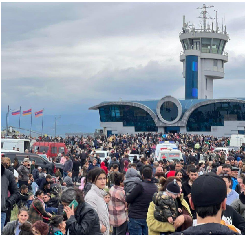
Evacuated people at the airport of Stepanakert, NK