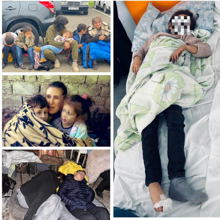
Figure 2 Affected children and elderly