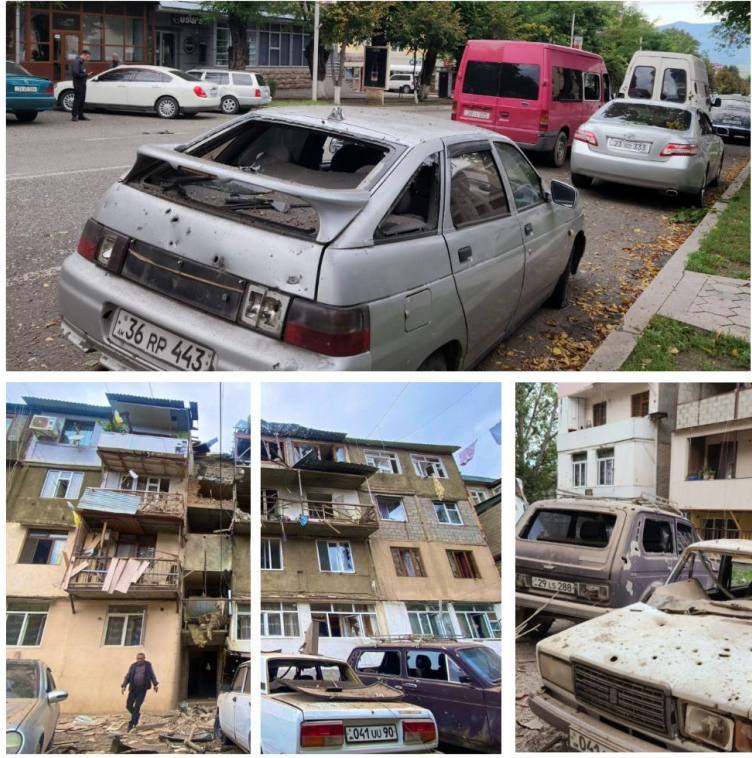
Figure 1 Residential houses damaged by shelling in NK